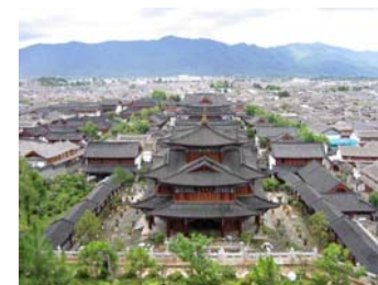
The Old Town of Lijiang

A number of places of historical interest and natural scenic spots there, such as the Old Town of Lijiang, Jade Dragon Snow Mountain and Tiger Leaping Gorge, are awaiting your exploration.