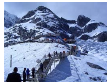
Jade Dragon Snow Mountain