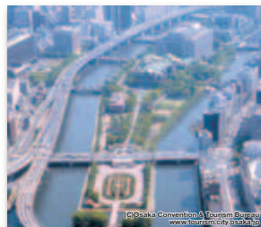
The water metropolis