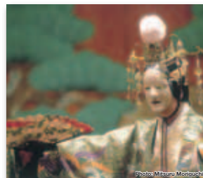
The performing arts