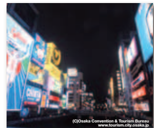
Foods shoppings and Entertainments