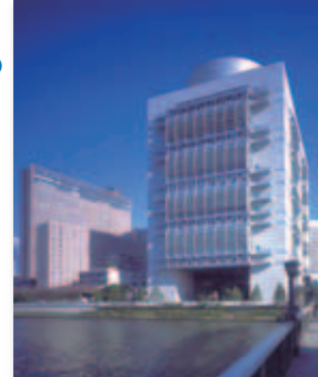
Osaka International Convention Center and RIHGA Royal Hotel Osaka (left)

Providing the world renowned hospitality for more than 70 years, RIHGA Royal Hotel Osaka is the largest hotel in western Japan, and is connected through a corridor to Grand Cube Osaka.